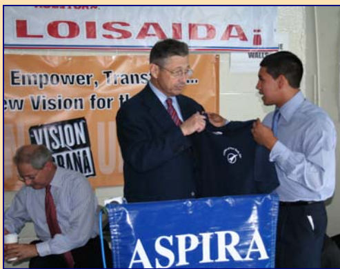
An Aspirante presents a token of appreciation to Assembly Speaker Sheldon Silver.

ASPIRA of New York announced the launch of a leadership development program for young people on the Lower East Side of Manhattan made possible by a grant from Assembly Speaker Sheldon Silver.